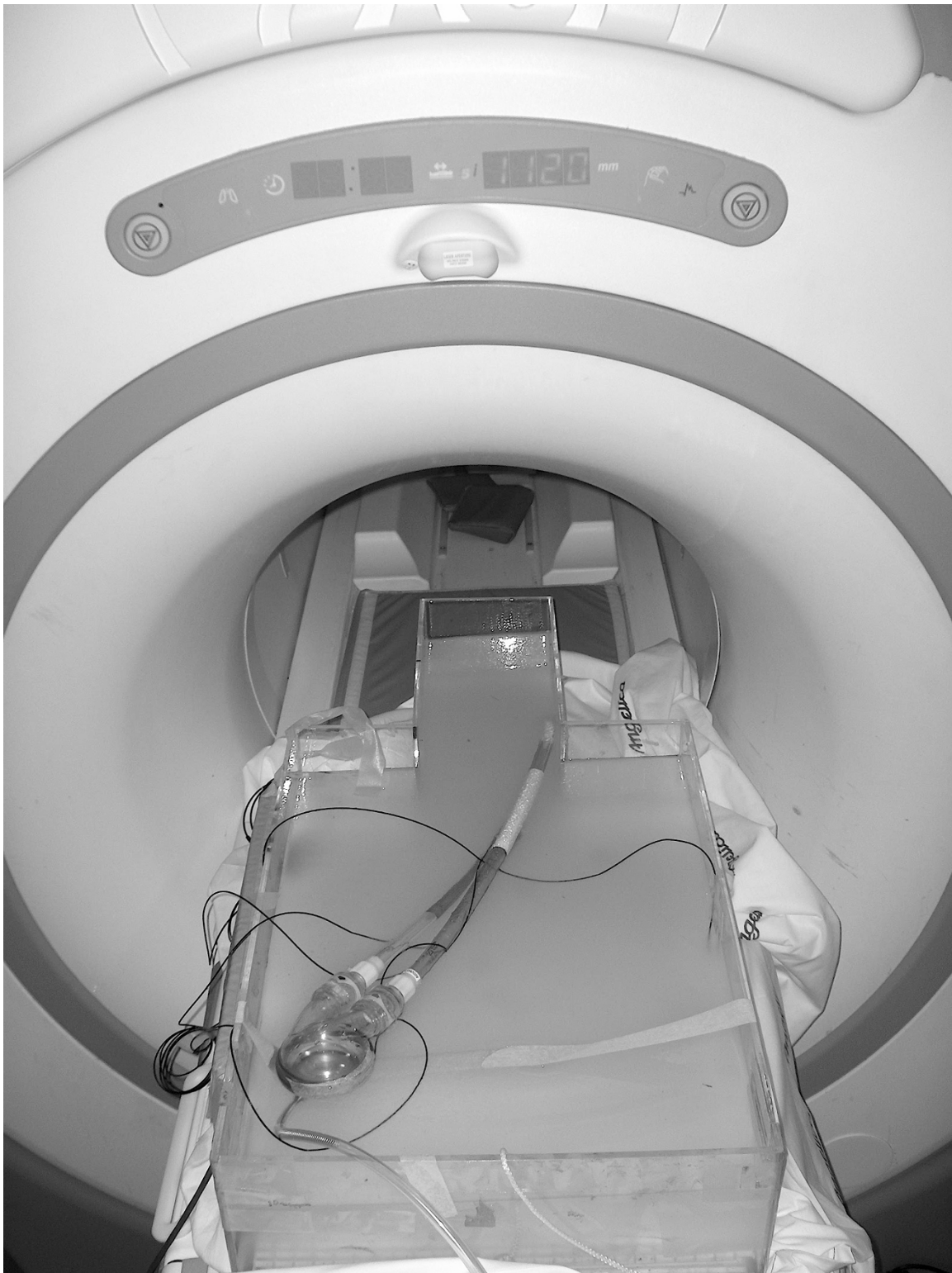
Figure 2 Experimental set up showing the 3-Tesla MR system and head/torso phantom used for the evaluation of MRI-related heating for the Ventricle with the prototype Nitinol wire-reinforced In-Flow Cannula and Out-Flow Cannula. Note the cables going to the fluoroptic thermometry probes of the thermometry system.