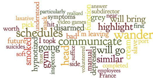
FIGURE 4: Word map of text-based predictors of GHQ-12 \geq 4 from NLP (English).