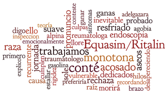
FIGURE 3: Text-based predictors of suicidal ideation from NLP (Spanish).

The preliminary evidence from this project demonstrates that NLP-based modeling has the potential to be an important tool for preventing suicide among young adults that frequently use text or social media. The technology could be extended to generate risk flags for patient messages sent to physicians, who could then intervene for a potentially suicidal patient. In nonclinical settings, publicly available, user-generated text may be a less expensive and less invasive data collection method for identifying persons at risk of suicide or monitoring trends in suicidal ideation. For people identified as at risk for suicide who are in nonclinical settings, resources such as crisis text lines could be made available instantly and electronically.