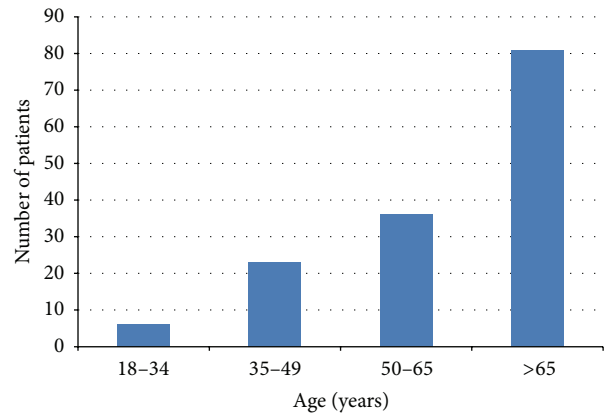
FIGURE 1: Patient age.