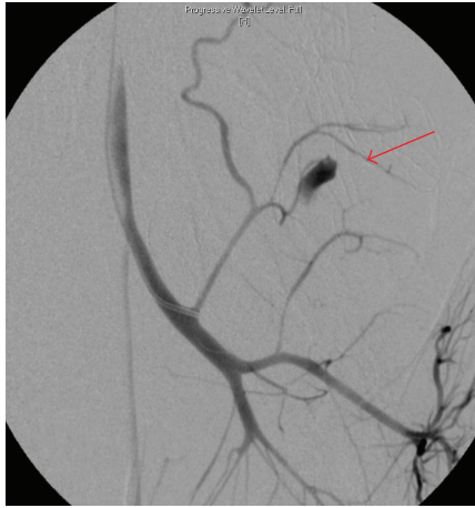
FIGURE 1: Angiography showing a blush from a dorsal branch from the left internal iliac artery (arrow).

showed a large amount of abdominal fluid and clots. Laceration of the liver or spleen due to the chest compressions during resuscitation was suspected and because of ongoing hemodynamic instability immediate laparotomy was performed. A large expanding retroperitoneal haematoma in the left lower quadrant of the abdomen was identified and explored showing a bleeding at the level of the lumbar vertebrae. Attempts were made to control the haemorrhage by suturing, application of local haemostatics, and gauze packing.