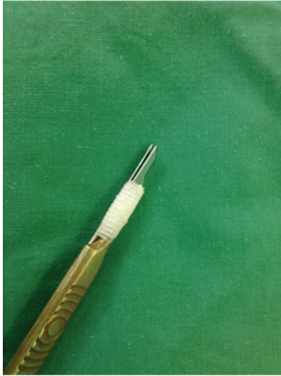
FIGURE 1: Two separate 15-blade scalpels joined tightly together with a sterile tape on a blade holder resulting in a double-blade scalpel.