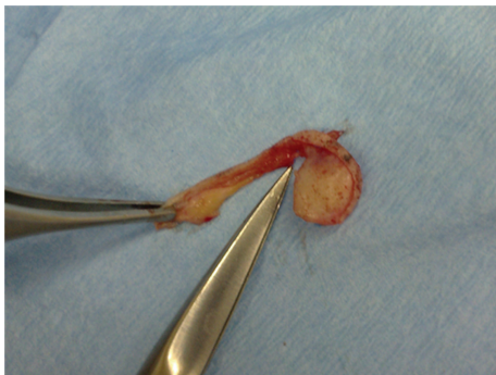
FIGURE 5: The peripheral skin is cut by seizures.

Cernea et al. presented a study on the reliability of using DBS for the comprehensive excision of surgical margins in large tumors of the head and neck. The preliminary findings of their study showed that the use of DBS is beneficial in harvesting skin and soft tissue margins of large head and neck tumors [13]. The DBS has also been used as an alternative for complete histological margin control in hospitals where it is difficult to perform Mohs surgery. A number of basal and squamous cell carcinomas were excised with a DBS and the tissue strips proceeded to intraoperative histological evaluation. The authors managed to obtain good surgical margin control and no local recurrences were reported [14]. Moossavi et al. were the first to introduce the use of DBS in Mohs surgery. They presented a case of a large dermatofibrosarcoma protuberans (DFSP) where margin control was essential. While Mohs surgery provided the good peripheral margin control needed, the use of DBS reduced the time required to harvest the margins of the massive lesion [15].