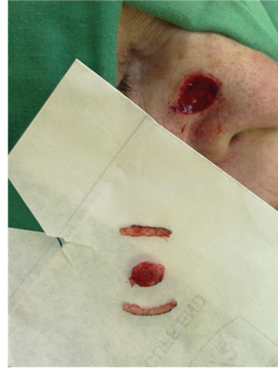
FIGURE 6: The tumor specimen is divided into pieces: central and peripherals.

In our study the use of DBS in Mohs surgery is extended to varying sizes of head tumors over a period of 18 months and a total of 170 cases treated. DBS is found to be highly effective in harvesting uniform strips of tissue in all cases. DBS's ease of use allows less experienced surgeons to thoroughly excise the peripheral tissue strips needed for the histological evaluation, minimizing the operation error. In the hands of a more experienced surgeon, DBS is timesaving,