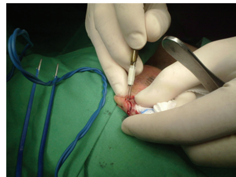
FIGURE 3: The DBS is used for the 90° vertical incision around the tumor.

Surgical excision techniques are the treatment of choice for MSCs and NMSCs. Indications for Mohs surgery include