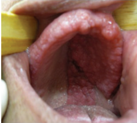
FIGURE 1: Verrucous lesions without facial midline involvement.

At the age of 16, patient had a left parotid gland myxoid tumor, being submitted to a partial parotidectomy surgery. After two years, the tumor returned, and she had another surgery. During the new operation, the left facial nerve was injured, resulting in an ipsilateral peripheral facial paralysis. After the procedure, patient received adjuvant radiotherapy.