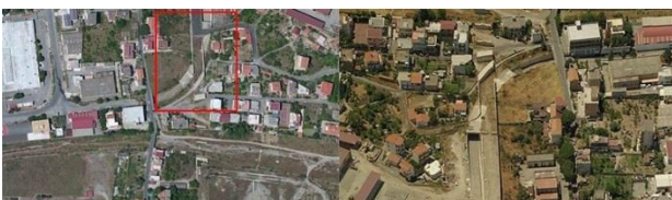
Figure 3. Position of the second work surveyed

Always in San Gregorio, in the city of Reggio Calabria, a box-shaped road tunnel (Figures 3 and 4) was found, with a length of 100 m and a width of 11.80 m, shoulders have a width of 1.30 m and a height of 5.50 m, the concrete slab thickness is 1.30 m. The work has not yet been completed and there are signs of efflorescence, moisture spots, due to bad or non-existent waterproofing (Bae, Golparvar-Fard, White, 2013).