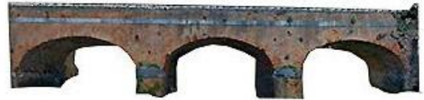
Figure 14. Texture of the Villa San Giovanni Bridge by Laser Scanner

The evaluation of the precisions was based on the 5 survey target placed on the deck facades and on the comparison of the results obtained with a traditional topographic survey with the Leica TCRA 1201 high precision automated station (Figure 15) (Barrile, Meduri, Bilotta, 2014a), (Barrile, Meduri, Bilotta, 2014b).