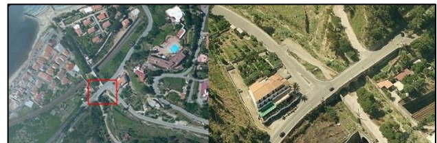
Figure 5. Bridge framing in Villa San Giovanni

The third surveyed work is a bridge located at km 517.20 of the SS 18 in the Villa San Giovanni municipality in the province of Reggio Calabria (Figure 5 and 6). The work was chosen in view of its particular design; in fact, it is made up of an original masonry structure consisting of three spans with 6.60 m light and two 1.50 m wide poles with a length and a width of 27 m each 6.30 m. This structure, following the adjustment and extension of the road section, was alongside a new in reinforced concrete, always at three lanes with lights of 7.20 m, a width of 4.20 m, also, length of 27 m. They are commonly found in masonry work, missing or broken elements, efflorescence traces and a general degradation due to time spent and poor maintenance. The part in reinforced concrete has traits with concrete dilution, efflorescence, expulsion of the cover, spraying of the casting, losers, these, from a misalignment of the work.