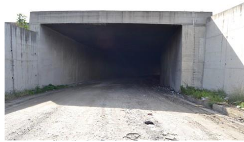
Figure 4. Detail of the tunnel entrance

The third surveyed work is a bridge located at km 517.20 of the SS 18 in the Villa San Giovanni municipality in the province of Reggio Calabria (Figure 5 and 6). The work was chosen in view of its particular design; in fact, it is made up of an original masonry structure consisting of three spans with 6.60 m light and two 1.50 m wide poles with a length and a width of 27 m each 6.30 m. This structure, following the adjustment and extension of the road section, was alongside a new in reinforced concrete, always at three lanes with lights of 7.20 m, a width of 4.20 m, also, length of 27 m. They are commonly found in masonry work, missing or broken elements, efflorescence traces and a general degradation due to time spent and poor maintenance. The part in reinforced concrete has traits with concrete dilution, efflorescence, expulsion of the cover, spraying of the casting, losers, these, from a misalignment of the work.