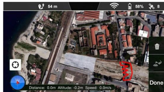
Figure 7. Ground station screen with flight plane

the various surveys were set in automatic mode by the formulation of flight planes, set by the input of track points with known coordinates of ground-based landmarks with RTK kinematics rover GNSS implemented in previous phases (also useful in Processing phase for model scaling). The possibility of real-time control of the drone through a ground station has allowed detailed and accurate shooting of the works investigated, monitoring the position, the quota and the state of the device (Figure 7).