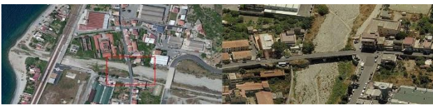
Figure 1. Position of the first work surveyed

For this contribute three distinct works have been acquired by nature and complexity. First, was surveyed a bridge in reinforced concrete located in San Gregorio in the town of Reggio Calabria. It consists of three spans in reinforced concrete, each of which consists of five longitudinal beams of 13.75 m long, with a section of 0.40 mx 0.70 m, of 1.40 m which are connected by traversers having a section of 0.15 mx 0.30 m spaced at a distance of 2.75 m (Figures 1 and 2). The artefact has several problems both with regard to metal reinforcements, in advanced oxidation state and in concrete, characterized by important and diffused areas affected by the separation of the concrete cover. It is therefore evident that there is a need for interventions aimed at the restoration and consolidation of all structural elements of the bridge (beams, traversers and slats), which cannot ignore the knowledge of the geometry of the various structural elements and the determination of the position, number and the section of the metal armatures.