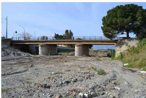
Figure 2. Detail of the San Gregorio Bridge

Always in San Gregorio, in the city of Reggio Calabria, a box-shaped road tunnel (Figures 3 and 4) was found, with a length of 100 m and a width of 11.80 m, shoulders have a width of 1.30 m and a height of 5.50 m, the concrete slab thickness is 1.30 m. The work has not yet been completed and there are signs of efflorescence, moisture spots, due to bad or non-existent waterproofing (Bae, Golparvar-Fard, White, 2013).