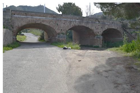
Figure 6. Detail of the bridge of Villa San Giovanni