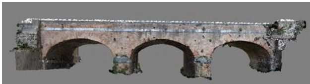
Figure 12. Texture of the Villa San Giovanni Bridge