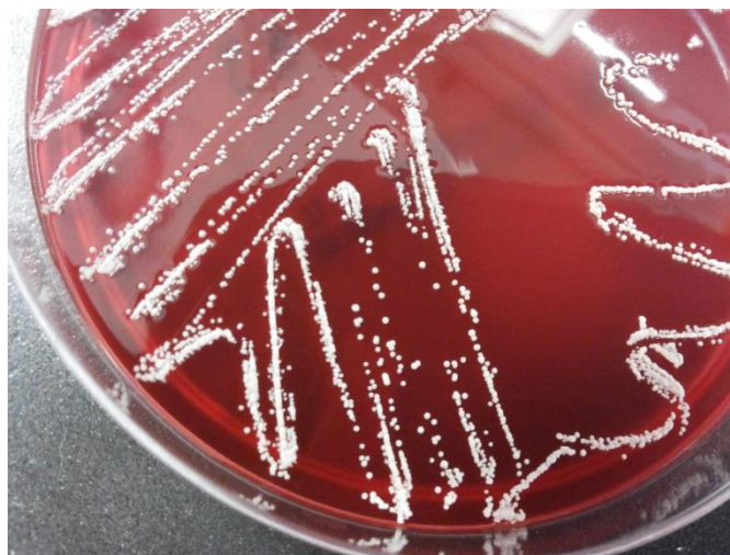
Figure 2. Whitish chalky colonies of N. paucivorans yielded on blood agar.

The suspicion that this strain could belong to Actinomycetales genus was based on its failure to clear casein (Biorad, France), on the resistance to lysozyme and 5-fluorouracil, and on the enzymatic profile, by the API ZYM system (bioMérieux, France). 1-2 Identification was completed by the evaluation of the absence of urease after growth on Christensen urea agar and incubation at 25°C for three weeks and of the incapacity to clear casein (Biorad, France). Finally,