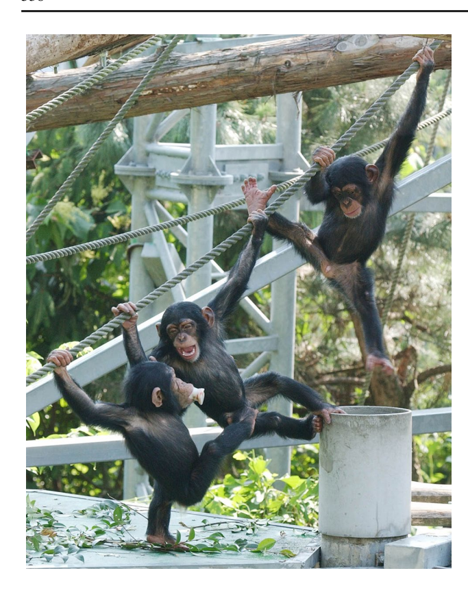
Fig. 1 Three focal chimpanzees at the Primate Research Institute, Kyoto University, Japan.