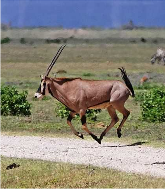
Fig. 4. — Oryx callotis galloping across an open grassland habitat in southern Kenya; such a gait is typical during circular tournament displays in which linear hierarchies are learned, tested, and reinforced (Kingdon 1997).