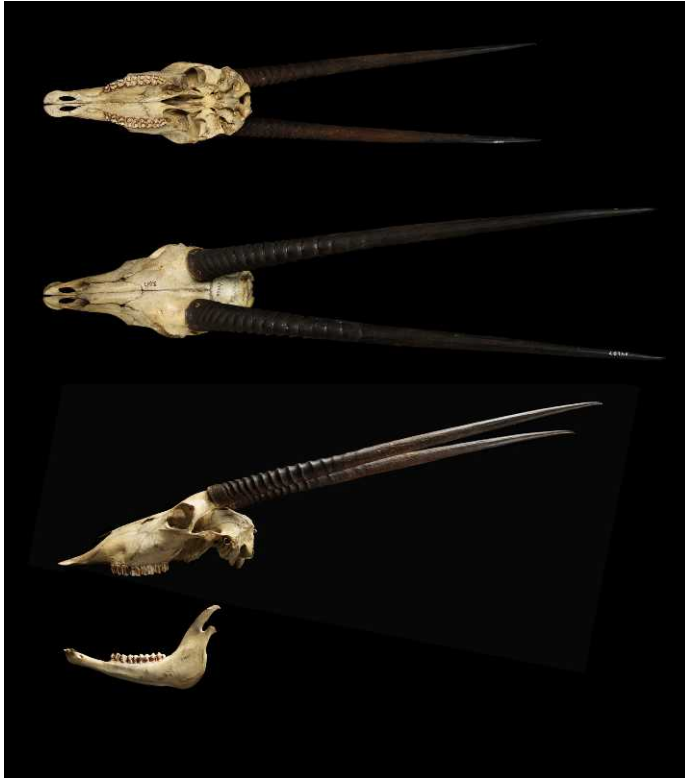
Fig. 3. —Ventral, dorsal, and lateral views of skull and lateral view of mandible of Oryx callotis (United States National Museum of Natural History, specimen 18944, sex unknown), collected by W. L. Abbott (date unknown) near Taveta in southern Kenya and the northern border of Tanzania. Greatest length of skull is 374.4 mm, average basal circumference of horns is 15.2 cm, left horn length is 70 cm, and tip-to-tip distance is 22.8 cm. The basal circumference of horns may suggest a male specimen, but the high degree of similarity of horn and skull measurements of female and male O. callotis makes it impossible to know the sex of this specimen (C. P. Groves, pers. comm.).

Galana Ranch in southeastern Kenya, daily fecal output in grams per day and percent fecal nitrogen concentrations of O. callotis were 1,378 \pm 91.2 SE and 1.22 \pm 0.051 in the dry season (April–August) and 969 \pm 67.5 and 1.57 \pm 0.022 in the wet season (January–May—Stanley Price 1985). The relatively low levels of fecal nitrogen suggested diets of only 7.6–10.2% crude protein (Leslie et al. 2008) and reflected the low-quality grasses that O. callotis generally consumed, regardless of season (Stanley Price 1985).