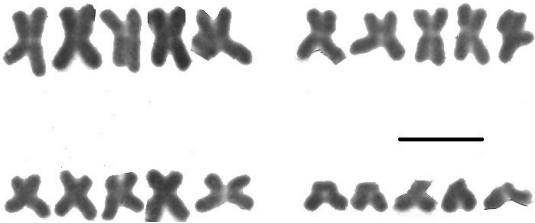
Figure 5. Girardia schubarti : pentaploid 5n=20; irrational multiple ( \lambda=2.5 ) of an original homeostatic 2n=8 complement presenting metastatic 5n sequence of n=4-aggregate of chromosomal morphologic forms (scale bar=10 \mu m).

a specimen, thus having an “off ploidy” (Pavelka et al., 2010), all chromosomal plates presenting numerically irrational multiples of that “off ploidy” (e.g. 3n, 6n) are combined and analyzed as a homologous entity with the predominant polyploidy being the divisor in total percentage calculations. Thus a specimen presenting 54 total plates where 5 plates=2n, 42 plates=3n, 4 plates=4n and 3 plates=6n, polyploids 3n and 6n are scalar multiples “1x” and “2x” respectively of irrational ( 2n \times 1.5=3n ) yielding off ploidal polyploid 3n. The number of 3n plates=42 and the number of 6n plates=3 \Sigma 42+3=45 total “off ploidal” count. Diploids 2n and polyploids 4n are rational scalar multiples “1x” and “2x” of diploid 2n. As the number of 2n plates=5 and the number of 4n plates=4; thus \Sigma 5+4=9 (homeostatic diploid and polyploidy). Polyploid plates 3n+6n=45 predominate; thus 45/54=0.83x(n=4)=3.33+(2n=8)= 11.33=P.V.