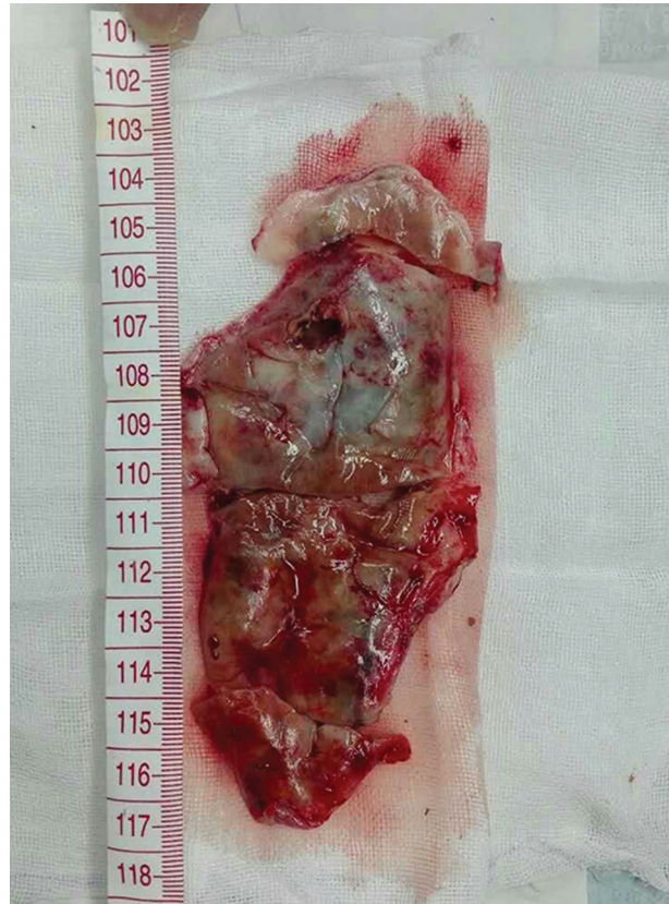
Figure 2. Pathological specimen of the abscess excised by craniotomy.

Brucella species are small, Gram-negative, non-motile, non-spore-forming, rod-shaped bacteria, and are involved