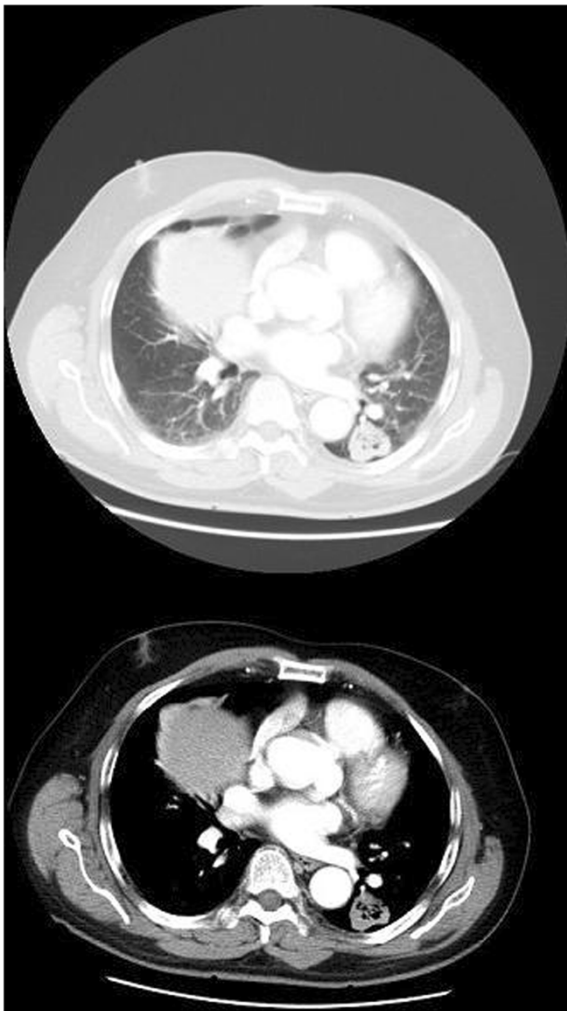
Figure 1 Thoracic CT-scan: Peripheral mass in left lower lobe with central cavitation.

cell carcinoma (SCC) stage IIa cT2aN1M0 and underwent left lower lobe lobectomy. The surgical specimen consisted of a peripheral mass in LLL measuring 4x3 cm consistent with SCC, carcinoma in situ (CIS) on the bronchial resection margin (Figure 2b) without nodal involvement of any of the 9 nodes resected. Several cuts of the hilar nodes were carried out but no neoplastic cells were detected. The postsurgical staging was pT2aN0M0 with CIS on the bronchial resection margin. A few weeks later a bronchoscopy with autofluorescence was performed. An area of low autofluorescence extending from the lobectomy stump to the main left bronchus was detected; the bronchial biopsy confirmed the CIS. The CIS was treated twice with endobronchial argon plasma coagulation. Due to local recurrence, the patient finally underwent pneumonectomy.