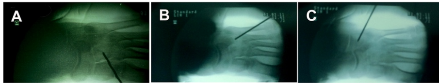
Figure 2 An X-ray machine was used to determine the midpoints of the (A) intermediate cuneiform, (B) lateral cuneiform, and (C) cuboid.

point “b.” The midpoints of the intermediate cuneiform, the lateral cuneiform, and the cuboid were defined as points “c,” “d,” and “e,” respectively (Figure 3A). PTT was then re-routed to reach the midpoints of the intermediate cuneiform, the lateral cuneiform, and the cuboid by applying 10 N pre-tension; during this procedure, the limb was placed in a neutral position (Figure 3B, C). We fixed one end of a suture to the point of “a,” then pulled this suture to the points of “b,” “c,” “d” and made markers on the suture, respectively. The lengths of “ab,” “ac,” “ad,” “ae” were measured by determining the length of part of the suture which began from one end to the marker points, respectively. All the lengths of “ab,” “ac,” “ad,” and “ae” were individually measured. If the length of PTT was sufficient to reach the midpoints of the three bones, an angle was measured between the tendon outside the fascia connecting to the different bones and inner layers. To prevent the muscle-tendon force distribution, we placed the line of pull as close to the vertical line as possible. To measure the angle produced by tendon