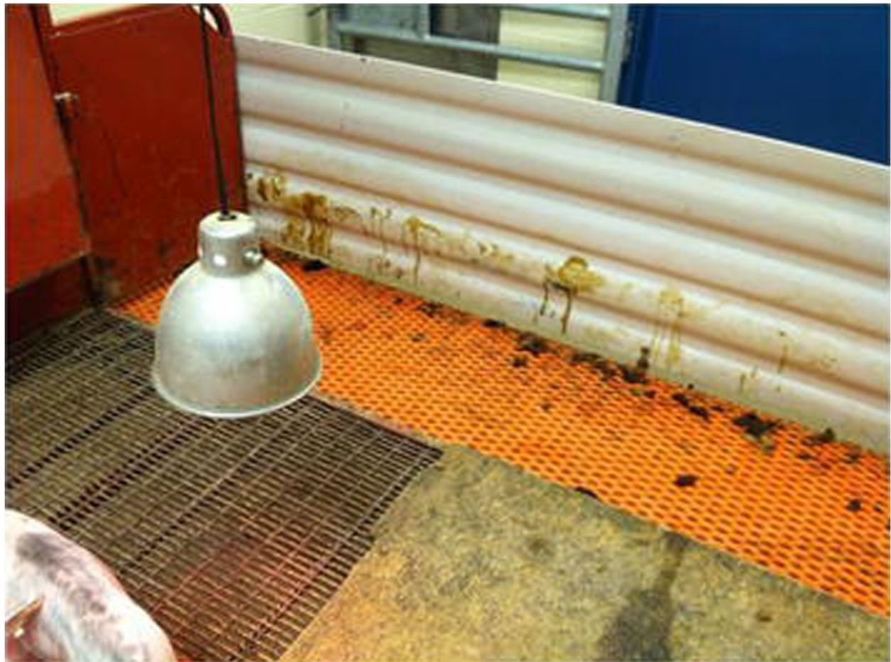
Figure 2 Diarrhea in the treatment group pen. This figure illustrates fecal staining on the wall of the pen housing the Treatment group piglets. This image was taken on day 6 post-ingestion of PEDV-positive feed.

For select samples, it was planned to conduct nucleic acid sequencing of the PEDV S1 gene. Specifically, fragments of the S1 domain of the spike gene were amplified from extracted RNA. Primers 1: (5'- ATGARGTCTTT AAYTACTTCTGG-3'), 2: (5'-CATCCTCACCWGCA CTAGTAAC-3'), 3: (5'- GTTGTGCTATGCAATATGT TTAY-3'), 4: (5'-TGAAATTAATTGTGACAGCATC-3'), 5: (5' -TTGTCATCACCAAGTAYGGTG -3'), 6: (5'- CT AAAAGACAGGTAATCATTAACAG- 3'), 7: (5'- CTG TGTTGACACTAGACAATTTAC- 3'), 8: (5'- CATACT AAAGTTGGTGGGAATAC- 3') were designed to anneal to conserved genomic regions. Incorporation of degenerate bases maximizes the ability of the PCR to amplify genetically divergent PEDV variants between the US and UK strains. Primer pair 1 and 2 obtained a PCR product size of 670 bp, primer pair 3 and 4 obtained a PCR product size of 678 bp, primer pair 5 and 6 obtained a PCR