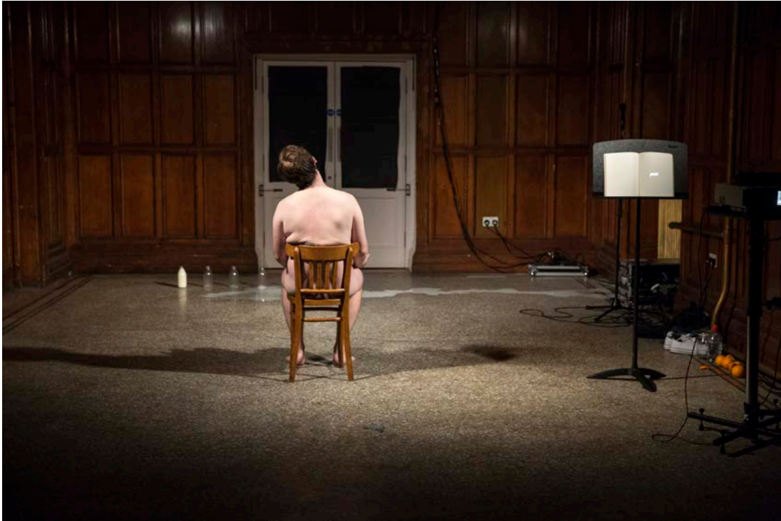
Figure 7: 'I turned the chair to the back of the space and delivered the sequence of poses facing away from the audience...'