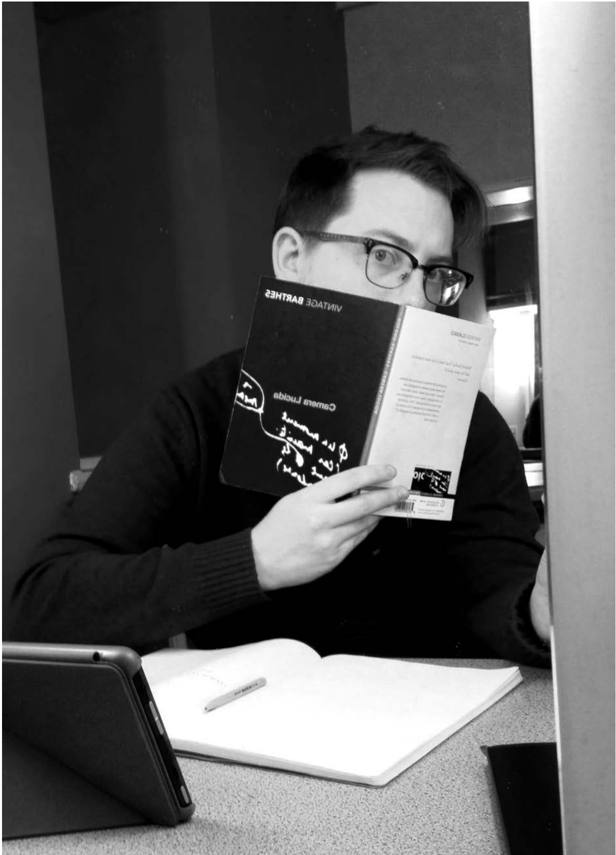
Figure 2: 'posing with Camera Lucida...'