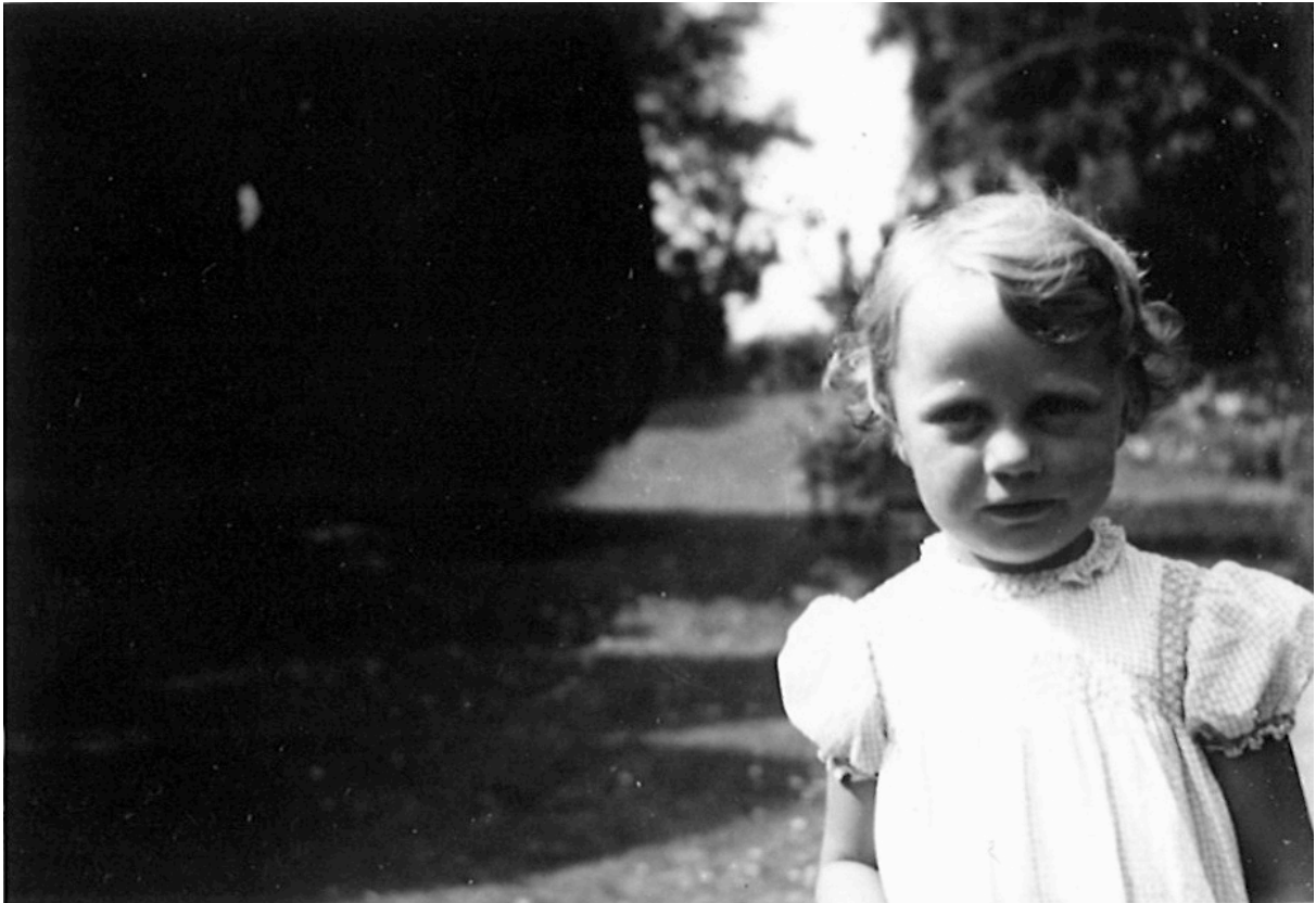
Figure 5: 'I fill the space left by the Winter Garden Photograph with an image of my own mother as a child...'