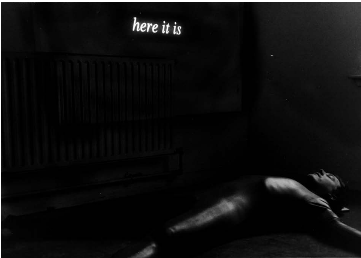
Figure 4: 'he transforms himself in advance into an image...'