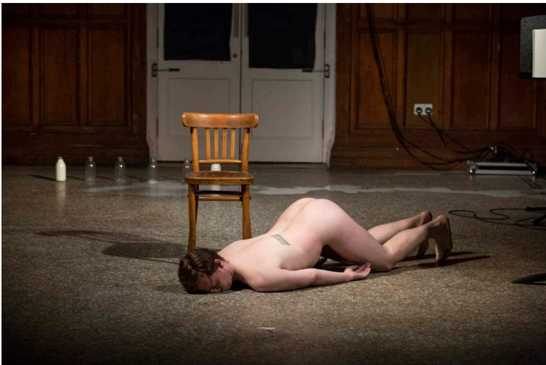
Figure 8: 'references to vulnerable/desirable/abstract/tortured/male/female bodies...'