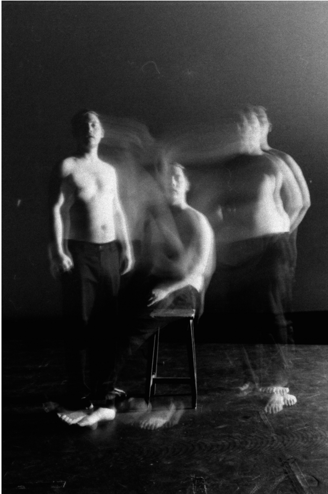
Figure 3: 'the portrait's inherent theatricality...'