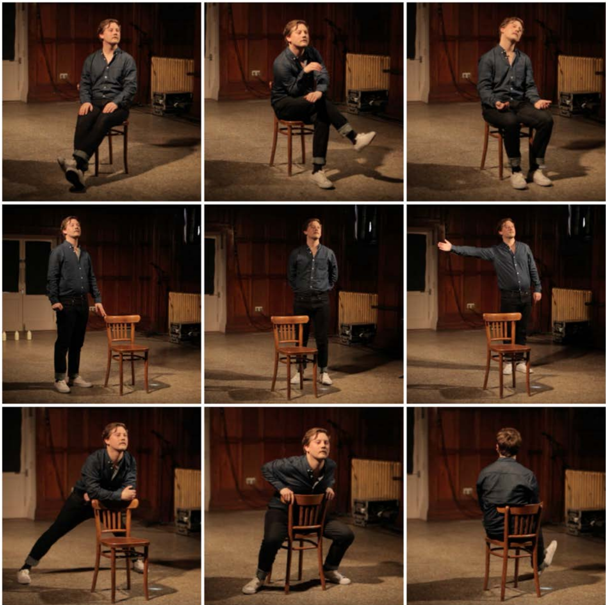
Figure 6: 'the still-act does not entail rigidity or morbidity it requires a performance of suspension...'