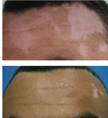
FIGURE 1: Repigmentation observed after melanocyte transplantation for the treatment of stable vitiligo.

Pharmacological treatment consists of a topical and systemic corticosteroid therapy, topical calcineurin inhibitors such as tacrolimus and pimecrolimus, pseudocatalase, melagenina (human placental extract), and vitamin-D derivatives [3, 7].