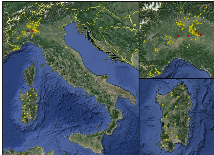
Figure 3 Distribution of farms of cattle sera tested for specific antibodies to Besnoitia besnoiti in the two samples areas: Mainland northwestern Italy (including Lombardy, Piedmont and Liguria regions) and insular Italy (Sardinia Island). Positive farms are in red.

reaction to B. besnoiti in WB. Cases of BB were previously registered in Piedmont [14,15], therefore we cannot exclude the presence of foci of infection in areas or herds not included in the survey. Of particular interest is the absence of BB in Sardinia, probably thanks to its geographical features and to the limited exchange in the purchase of spare breeding animals that contributes to prevent the spread of infections from the continental areas.