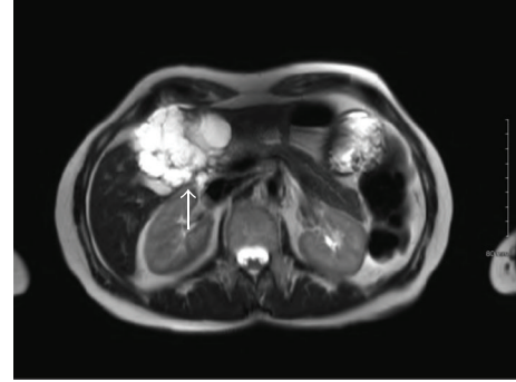
FIGURE 1: MRI image detailing a 6.6 \times 5 cm cystic mass originating from segment 4B of the liver (arrow).

3.2. Micro. Microscopic findings of the mass were composed of proliferation of variably sized tubulocystic structures lined by cuboidal epithelium, embedded in a fibrous stroma (Figure 2). Many areas of the lesion consisted of small tubules and cystic spaces lined by cuboidal biliary epithelium without atypia. There were multiple foci of epithelial atypia (including cytologic atypia and architectural atypia with cribriforming and a back-to-back arrangement of glands) that represented high-grade dysplasia. A small focus of invasive carcinoma was found ( <1 mm), with increased atypia (including mildly enlarged epithelial cells with prominent nucleoli, a rare single cell in the stroma, and disrupted glands that merge with the sclerotic stroma) that could