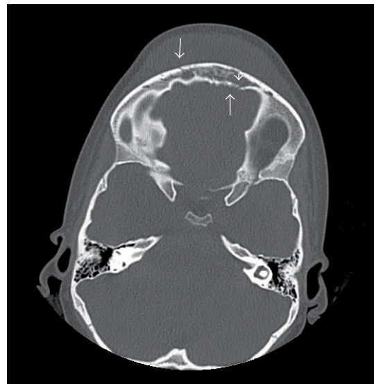
FIGURE 3: Axial CT without contrast on presentation demonstrating erosion of the anterior and posterior tables of the frontal sinus (arrows), frontal sinus opacification (arrowhead), and soft tissue swelling of the forehead.

drained forehead and intracranial abscesses. To address the sinus disease, we utilized image guidance to create a left nasal antral window, bilateral frontal sinusotomies, anterior ethmoidectomies, and uncinectomies. Purulent fluid was obtained from the left middle meatus, left maxillary sinus, and left ethmoid bulla. Specimens were sent for gram stain, aerobic, anaerobic, fungal, and acid-fast cultures.