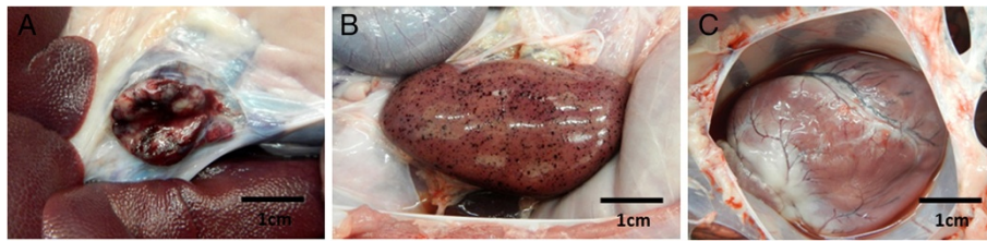
Figure 1 Macroscopic lesions observed in organs of domestic pigs infected with the Georgia 2007/1 ASFV strain. A) Enlarged and haemorrhagic hepatogastric lymph node from a between-pen contact pig terminated at 11 days post exposure. B) Multifocal cortical haemorrhages (petechiae) on kidney from an inoculated pig terminated at 8 days post-inoculation. C) Fluid in pericardial cavity (hydropericardium) from a within-pen contact pig terminated at 12 days post-exposure.

signs and virus shedding were compared per group using a t-test. The type of post-mortem lesions were compared between groups using a one-way ANOVA test. The values of clinical scores and viral shedding were compared between groups in relation to time using a linear mixed effect model. All statistical analyses and plots were performed using the R statistical program [20]. The packages “epi.studysize”, “lme4”, “lmerTest”, “latticeExtra” and p < 0.05 were used to indicate statistical significance.