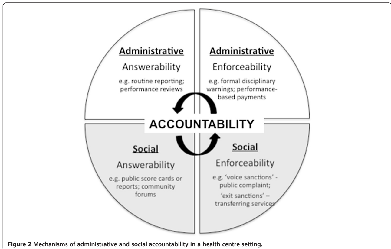
Figure 2 Mechanisms of administrative and social accountability in a health centre setting.

A full description of the study design and data collection methods used in this and the larger research project has been published previously [24]. Briefly, we adopted a multi-case study design using a theoretical replication strategy [45]. Case ‘units’ – four primary health centres located in two adjacent Districts, one urban one rural – were selected by the lead investigator (SMT) in consultation with District Medical Officers, and based on both empiric and anecdotal evidence of characteristics that enabled exploration of patterns of service delivery. Such characteristics included: average patient attendance data; vaccination coverage rates; and District officers’ descriptions of health centre performance. Data were collected between June and December 2011. Methods used at each case site included: in-depth interviews with a proportionate sample of healthcare workers from various levels (n = 60); semi-structured interviews with a quasi-random sample of patients (n = 180); review of health centre paper-based registers; and direct observation of facility operations