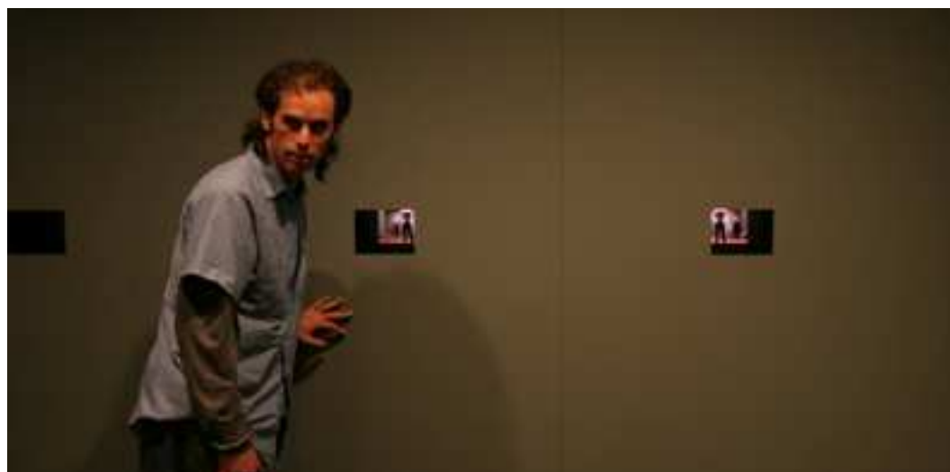
Figure 6: Dislocation and the participant as performative agent.

Time's Up has long aimed to build 'worlds', and these worlds take maximal advantage of the inbuilt interactions of the physically active and present world, adding layers and levels through mixed reality systems as Dislocation embodies. An interest in such worlds is not evoked through undue complexity, rather through a form of simplicity and most importantly, of openness to any and all forms of action. Here illusion often plays an important role.