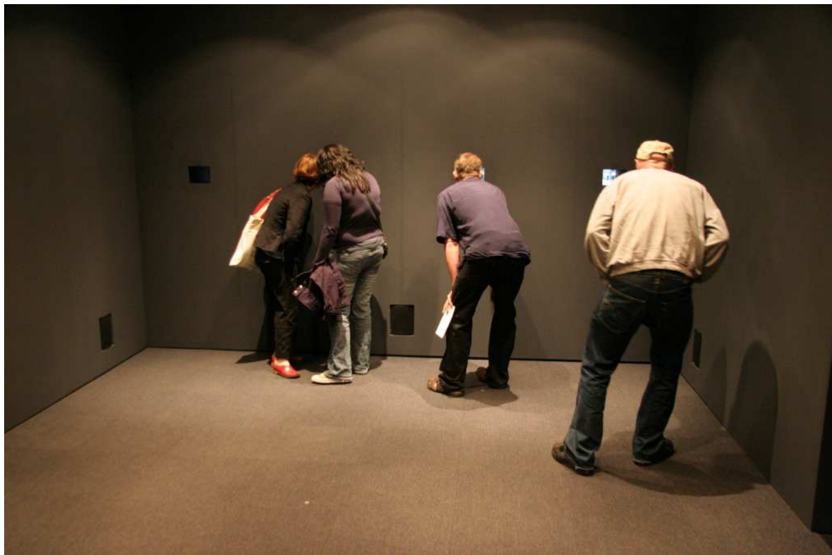
Figure 3: Dislocation : Installation view with audience Interaction, F.A.C.T, U.K. 2006

Dislocation is a gallery based installation in which visual and auditory displays combined with audience locational data create the impression that realistic virtual characters inhabit the same physical space as the audience. 2