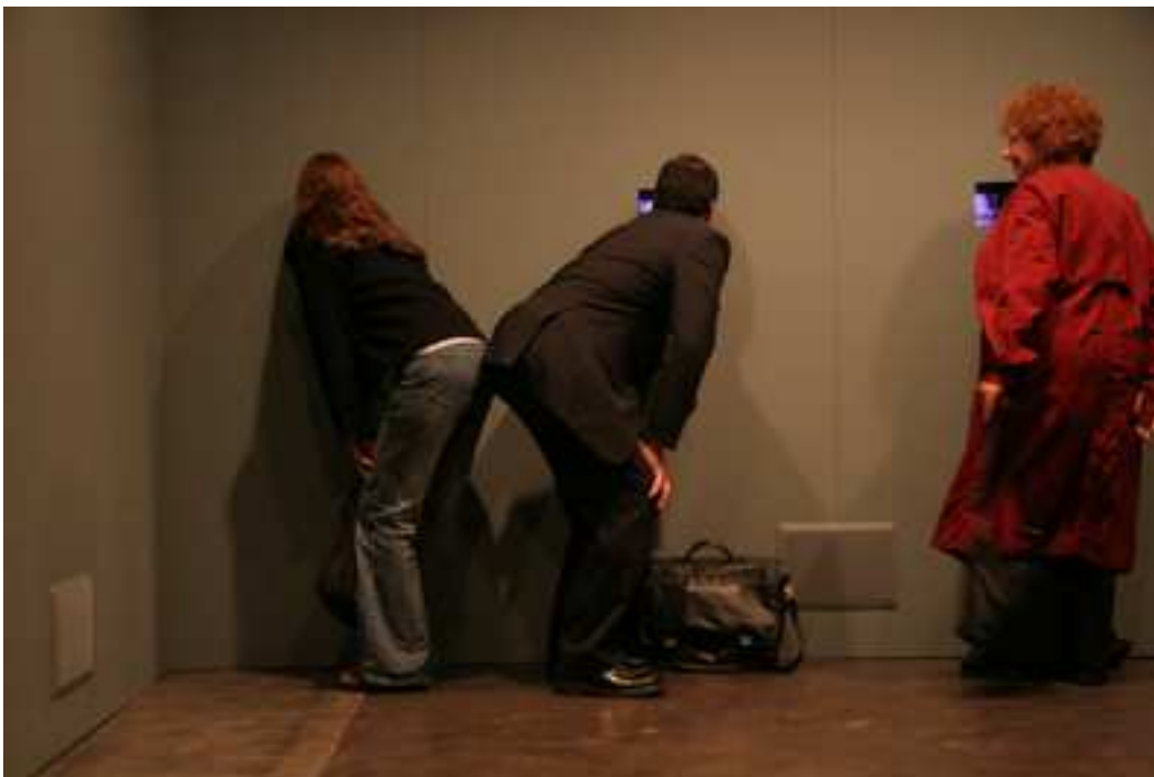
Figures 9 & 10: Mixed modes of participation and performativity. (Top) In Unreal Installation a large audience observes participants inside the work. (Bottom) In Dislocation one participant watches others engaged with the MR work, this as part of her own overall involvement.