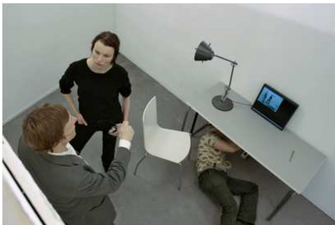
Figures 1 & 2: (Above) Dislocation – on site in the construction of a multi-layered space for audience engagement. (Below) Unreal Installation – practical work in connecting media and the set's actor testing the mediated system.

Rarely do we encounter design-oriented analyses of embodied interaction such as is characteristic of our engagement with the mix of physical location and the unfolding of live and stored digital mediations. It is rare to find critical accounts of the design considerations in realizing mixed reality (MR) art works and their combinatorial practices of creative construction together with the design based shaping of potential for participant expression and