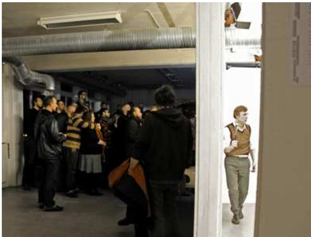
Figure 7: Unreal Installation with audience and actor copresent

Rather than creating an interactive narrative based around choice and multi-linear plots, the Unreal Installation addresses issues of non-timing and the boundaries of film and performance. The rules of dramatic effects apply as in traditional film and theatre: distances between characters, timing of response and action, and dramatic irony. The viewer moves back and forth within the same narrative context, navigating or simply injecting himself/herself into the loop by his/her presence. This adds a tactile dimension to the activity of viewing moving images; a bridging of the cerebral process of interpreting visual information with the corporal sensation of 'touch' and participation occurs. At the core of the work there is dramatic interpretation via different traditional sub-genres such as mime, comedy and tragedy. Elasticity in timing and repetition as well as the tactile dimension are the additional ingredients in the construction of an ongoing story that can be 'played through.'