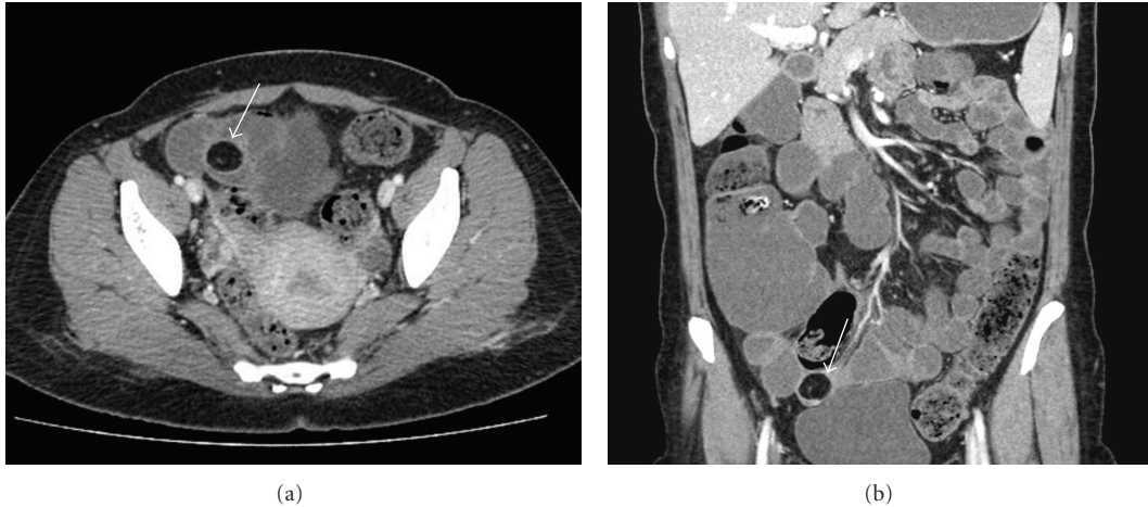
FIGURE 1: (a) Axial and (b) coronal plan contrast-enhanced CT scans demonstrate a well-circumscribed, intraluminal hypodense 25 \times 20 mm mass with fat attenuation ( -105 HU) in the terminal ileum (arrow). Any obvious sign of obstruction is not present on this CT.