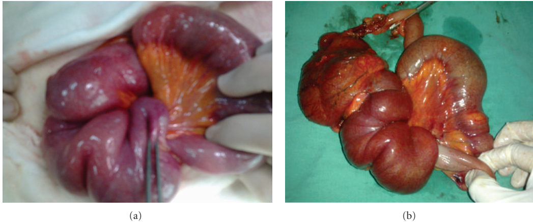
FIGURE 3: (a) Intraoperative and (b) postsurgical appearance of ileocecal intussusception. Ileocecal resection involving proximal half of the cecum and distal 30 cm of terminal ileum.

1% of all adult intestinal obstructions. 3 to 20 per 100,000 of hospital admissions was due to intussusception in adults [4, 6, 7]. Adult intussusception is usually caused by a tumor acting as the apex of the intussusception. Therefore, when the diagnosis of intussusception made, the possibility of the presence of malignancy in the bowel should be kept in mind. However, it has been reported that majority of cases of adult small-bowel intussusception are caused by benign entities, such as lipoma, polyp, Meckel's diverticulum, or adhesions. In both small- and large-bowel intussusception, lipoma is the most common benign tumor [4, 7].