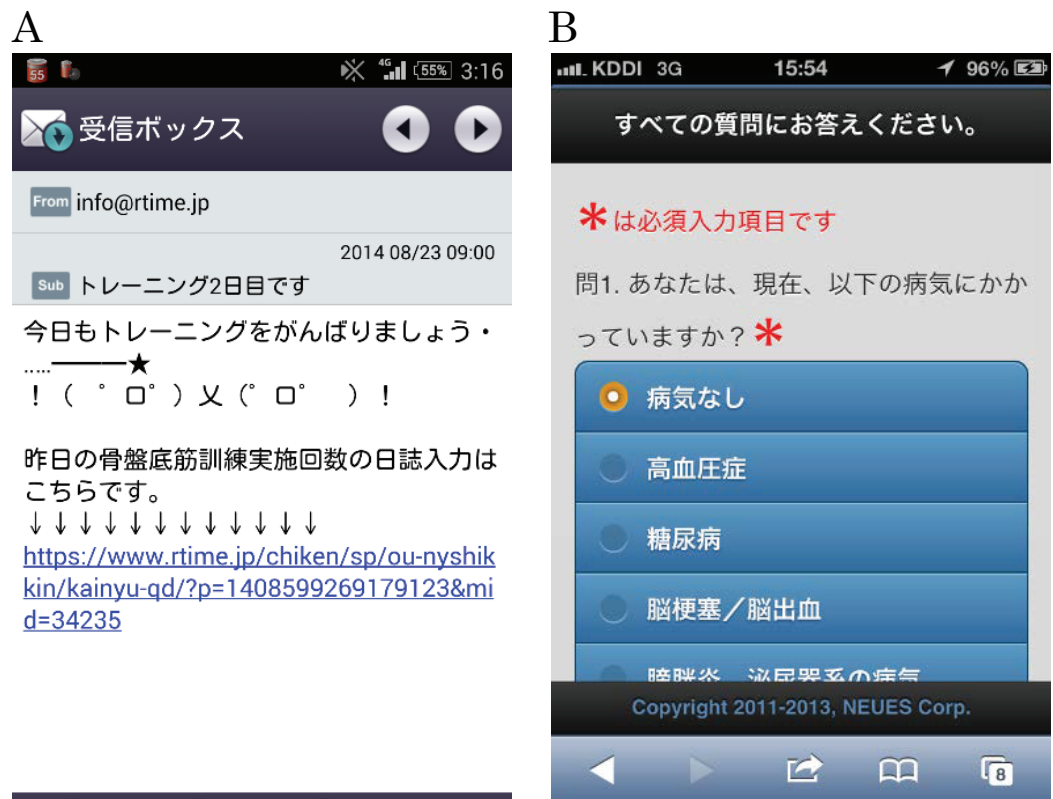
Figure 1 Screenshots of PFMT reminder e-mail and input screen for participant characteristics. (A) Screenshot of PFMT reminder e-mail. (B) Screenshot of input screen for participant characteristics.