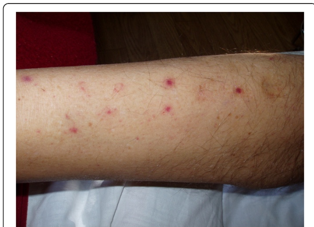
Figure 1 Numerous ecchymoses on the skin of the lower extremities in a patient infected with T. b. rhodesiense .

Routine laboratory examinations showed leucopenia (2.09 G/l), severe thrombocytopenia (10 G/l), shift to the left in Schilling's blood count (band cells 25%, segmented cells 48%), lymphopenia (12%), hyperbilirubinaemia (2.37 mg/dl), hypoglycaemia (30 mg/dl), elevated concentrations of creatinine (2.92 mg/dl) and urea (93 mg/dl), high activity of the liver enzymes (alanine aminotransferase 208 U/l, aspartate aminotransferase 217 U/l, gamma-glutamyl transpeptidase 162 U/l), marked elevation of the