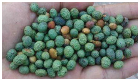
FIGURE 1: Pistacia khinjuk fruit which is called “kelkhong” in Iran.

discomfort, nausea, vomiting, and motion sickness [10]. In addition, reviews have reported P. khinjuk to have anti-inflammatory, antioxidant, antitumor, antiasthmatic, and antimicrobial properties [8]. The present study aims to evaluate the in vitro and in vivo antileishmanial activity of P. khinjuk extract and to compare its efficacy with a reference drug, meglumine antimoniate (MA, Glucantime) against L. tropica and L. major .