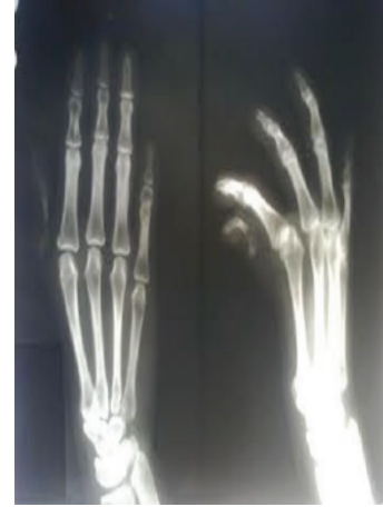
FIGURE 3: Absent first metacarpal bone of the left hand, underdeveloped distal phalanges of thumb and the little finger of both hands.

Electrocardiogram showed normal sinus rhythm with right ventricular hypertrophy with right axis deviation. Chest X-ray poster anterior view showed levocardia, cardiomegaly mainly of right atrium and the right ventricle, increased pulmonary vascular markings, and normal thoracic situs (Figure 2). Plain radiograph of both hands revealed absence of first metacarpal bone of the left hand, and underdeveloped distal phalanges of thumb and the little finger of both hands (Figure 3). Two-dimensional echocardiography showed ostium secundum atrial septal defect (Figure 4). Renal ultrasound and kidney function tests were normal. She was stabilized with medical management and underwent the complete intracardiac repair with pericardial patch closure of the septal defect under cardioplegic arrest on the second day of admission. On followup for the last two years, she is doing well and is asymptomatic regarding her cardiac symptoms without any medical therapy.