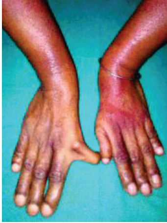
FIGURE 1: Rudiment thumb and little fingers with adductor deformity of both wrists.