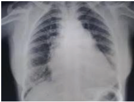
FIGURE 2: Cardiomegaly and increased pulmonary vascular markings.

left parasternal systolic lift, fixed splitting of the second heart sound, and a systolic murmur of grade IV/VI at left parasternal area.