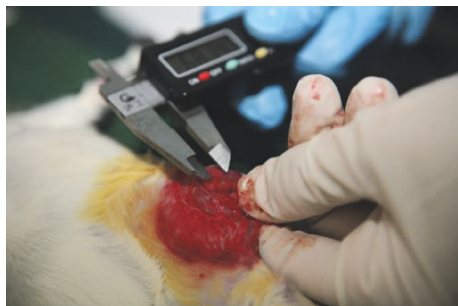
FIGURE 1: Measurement of explant volumes (length, width, and height) using digital millimetric caliper at second and third laparotomies.

concentrated by heating. The final drug concentration was 1 g/mL.