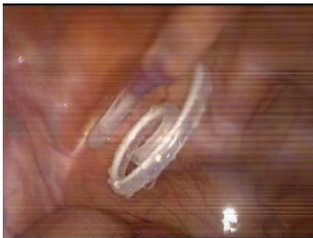
FIGURE 4: Tenckhoff catheter is introduced in the minor pelvis.