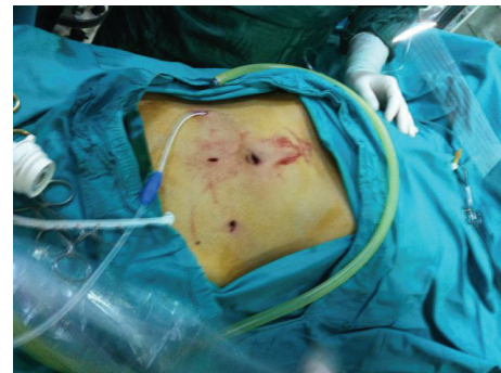
FIGURE 6: Exit site is created to the preferential of patient before the operation.

patients developed serious complications during surgery or the postoperative period. No mortality occurred in this series of patients. Mean follow-up period was 28.35 \pm 14.5 months (range of 13–44 months). Two patients developed an early leakage from the 5 mm port site, which was treated by application of a primary suture to the fascia of entering site. Bacterial peritonitis were seen in one patient at follow-up period and responded to antibiotic therapy. No infections of the exit site or subcutaneous tunnel, hemorrhagic complications, abdominal wall hernias, port site hernias, or extrusion of the superficial catheter cuff was detected. Eight patients (8.53%) developed catheter function disorders during three-year follow-up period, and each underwent laparoscopic revision, which restored catheter function. The cause of disfunction