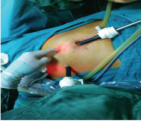
FIGURE 1: Entering sites of two ports.

complications. In fact, the incidence of omental wrapping, catheter displacement, and intraabdominal complications, specifically bowel and bladder perforation, is higher with these two methods [5, 9]. In particular in patients suspected of having intra-abdominal adhesions, the application of laparoscopic surgical techniques has significantly changed our surgical approach to dialysis catheter placement, but the debate on open or laparoscopic placement of PD catheters is still ongoing [5, 8, 10, 11]. Malfunction of the peritoneal catheter is a frequent complication in peritoneal dialysis and results in catheter loss. Therefore, it is vital that the dialysis catheter tip is sited and secured accurately in the pelvis if long-term catheter function is to be achieved. This has led to improvements in laparoscopic techniques, including the preperitoneal tunneling, pelvic fixation, omentopexy, or other minimally invasive one port insertions, which aims to minimize omental wrapping and catheter dislocation [11–20].