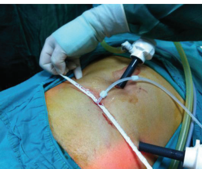
FIGURE 3: Peel-away sheet is taken out.