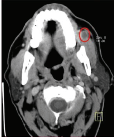
FIGURE 1: Head CT image showing a malignant lesion in the left buccal mucosa.

nodes, bone, liver, contralateral kidney, brain, pancreas, and skin [1–5].