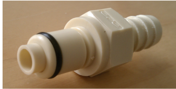
FIGURE 1: Polypropylene quick-disconnect tube coupling plug. Compatible with 3/8 inch internal diameter medical-grade tubing.

He first obtained a quick-disconnect valve which was designed to shut off flow of liquid from both ends while disconnected. In the patient's lab, the valve was used to prevent leakage when liquids needed to flow through a conduit intermittently. The specific polypropylene plug (Figure 1) and socket (Figure 2) components used were autoclavable and readily available from hardware supplier, McMaster-Carr (number 51545K91 [plug] and number 51545K74 [socket]). Colder Products Company is the manufacturer of the parts (number PLCD1700612 [plug] and number PLCD2200612 [socket]) (Figure 3). Both sides of the quick-disconnect valve were then configured with plastic connectors (Figure 4) so that they are compatible with medical grade tubing with a 3/8 inch internal diameter. The plastic connector from the valve was then attached to the suprapubic drain tube. Thick-walled silicone tubing, which would not be distorted during body movements, was then used to link the plastic connector on the valve to the drainage bag. The body of the socket contains a metal spring-loaded button that, when pressed, releases the valve connection and blocks the escape of fluid through the valve. At this point, the valve is separated and the urinary bag can be emptied, while maintaining a closed drainage system.