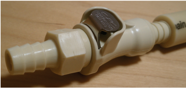
FIGURE 3: Polypropylene quick-disconnect tube coupling plug and tube socket with double lock-out valve, manufactured by Colder Products Company.