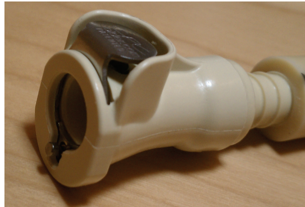
FIGURE 2: Polypropylene quick-disconnect tube socket with valve end-on.

To reattach the drainage bag to the drain tube, the valve between the catheter and the drainage bag is simply reconnected, and a click is heard. When both a leg bag and a night bag are outfitted with a valve plug, either bag type can readily be connected to the valve socket on his drainage catheter.