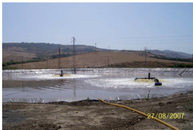
Figure 1. The full-scale aerobic-anaerobic aerated lagoon under investigation.

In the following discussion each tank will be indicated by the symbol "T xx,xx,xx ", where: the first two numbers of the subscript refer to either the position of the air diffuser ("0" for positioning above the tank bottom and "1/2" for placing at mid-depth) or other information about the experimental conditions ("IN" for tank with "inoculum" wastewater and "NA" for the tank not aerated); the intermediate numbers refer to the air flow rate ("7" or "14" L m -3 h -1 ); and the final two numbers refer to the aeration time ("12" or "24" hours). For example "T 1/2,7,12 " indicates the tank with the diffuser placed at mid-depth and subject to