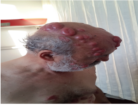
FIGURE 1: Prior to salvage treatment.