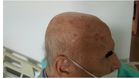
FIGURE 2: After salvage treatment.

Primary cutaneous lymphomas have better clinical course and prognosis [8, 9]. However, extensive secondary cutaneous involvement in systemic B cell lymphomas has been also reported in the literature [10, 11]. Very significant improvements were recorded in the management of DLBCL; however, it is still not usual to achieve cure with conventional treatment. The outcome of relapsed DLBCL largely depends on several factors such as fitness and chemosensitivity of the patient, eligibility for stem cell transplantation (SCT), IPI score at relapse, and time interval from previous chemotherapy. In the literature, it was stated that after