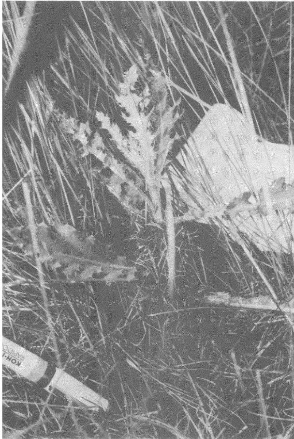
Fig. 2. Aphid-tent built by F. montana on Canadian thistle.

with an access route to the spittlebugs. Three ants appeared to take up some of the spittle by ingesting it. Spittle drinking has also been noted in yellowjackets (Akre et al., 1976).