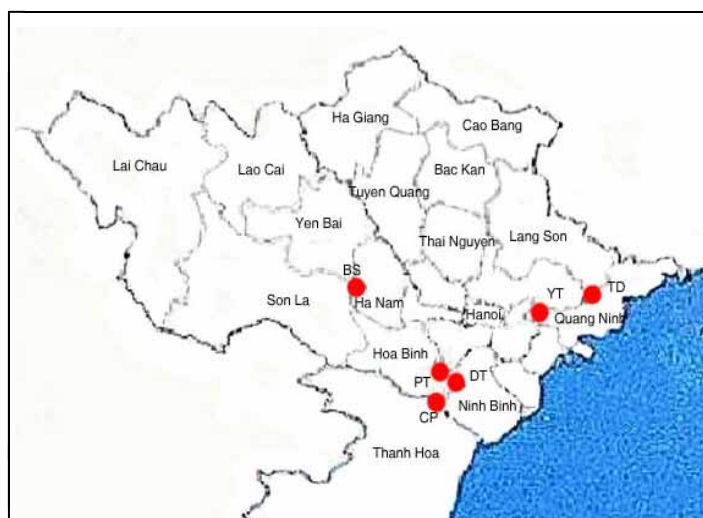
Fig. 1: Map showing the studying sites: PT: Phu Thanh, DT: Dong Tam, BS: Ba Sao, CP: Yen Quang, TD: Tan Dan, and YT: Yen Tu

84% in Dong Tam, Phu Thanh and Ba Sao, winter with low temperature, an average 16°C in January and summer with high temperature, averaging 28,5°C in July. In general, fertility of soil has greatly declined in these forests. Young leaves of 6 populations of Cycas balansae were collected in July and August, 2002 at 6 sites: Ba Sao (Ha Nam), Dong Tam and Phu Thanh (Hoa Binh), Yen Quang (Ninh Binh), and Tan Dan and Yen Tu (Quang Ninh). One hundred fifty-two (152) sampled individuals were used to analyze isozymes belonging to 6 populations. The collected samples were immediately kept in marked plastic bags and put in the icebox. They were transferred to the Laboratory of Molecular Biology, Institute of Ecology and Biological Resources, Hanoi and subsequently stored at -80°C until the time to use for enzyme electrophoresis. The distance between consecutively collected plants, age structure and density in each studied population was determined in the field.