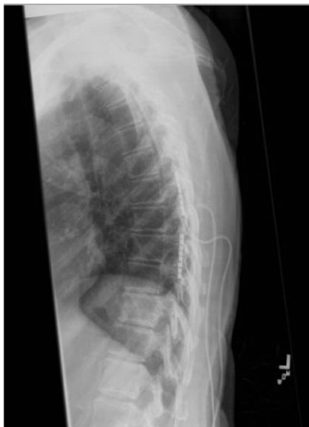
Figure 2 Lateral thoracic X-ray image showing permanent paddle lead placement in the thoracic interspaces.

Written informed consent was obtained from our patient for publication of this case report and any accompanying images. Institutional Review Board was not needed