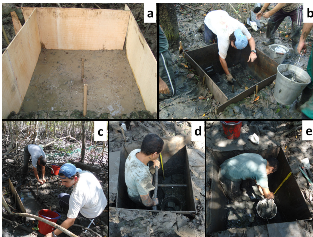
Figure 2 - Excavation of the five trench to remove the belowground root biomass. The excavation was conducted with scale support to measure the exact 1\text{m}^3 volume of sediment. a) First trench; b) second trench; c) third trench; d) fourth trench; e) fifth trench.

the living basal area ranging from 25.96 to 36.84 \text{m}^2\cdot\text{ha}^{-1} , the average DBH ranging from 11.00 to 12.66 cm, the average height ranging from 9.10 \pm 2.58 to 10.33 \pm 2.27 m, and the contribution in basal area indicating co-dominance of A. schaueriana and R. mangle (Table II).