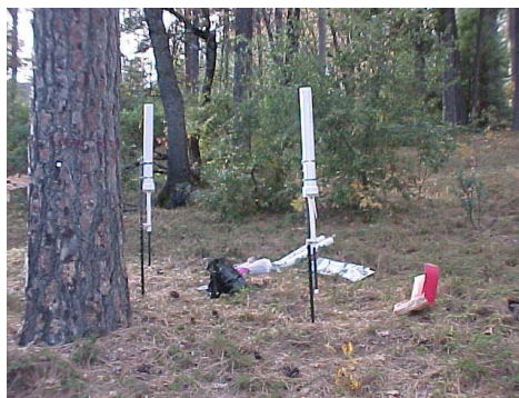
FIGURE 1. Ion exchange resin column throughfall collectors installed in the field. The smaller dark-colored tube at the bottom is the resin column. The large white cylinders at the top are the snow collector tubes. In summer, the snow collector tube is removed and a similar white cylinder is placed over the resin column to reduce direct exposure to solar radiation.

Both types of collectors were mounted on iron fence posts, with the collector opening ca. 1.5 m above ground level (Figs. 1 and 2). During snow-free periods all weather rain gauges (Productive Alternatives, Fergus Falls, MN) were used for the collection of throughfall for both types of collectors. The diameter of the funnel opening for these collectors is 10.0 cm [11,12]. An inert plastic screen (0.05-mm mesh size) was placed in the collector opening to exclude debris. Evidence of contamination from bird excrement, etc., was rare. During the summer, a white PVC cylinder (7.4-cm I.D.) was placed over the resin column to prevent direct solar exposure of the resin column. In winter, 7.4-cm diameter cylinders (1 m in length) were placed above the funnel collectors to allow for collection of snow. Fig. 1 shows the passive throughfall collectors with snow tubes attached to the top of the collector. Fig. 2 shows a close-up view of the bottom portion of the collector in winter (resin column is uncovered).