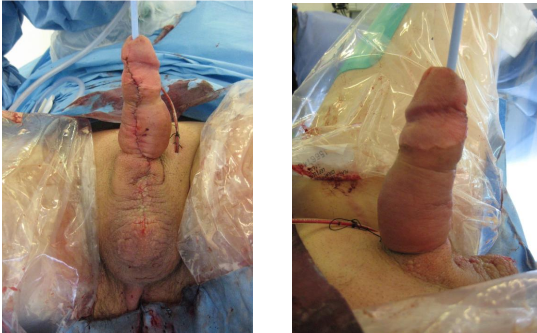
FIGURE 3. Immediate postoperative result of a subcutaneous excision for penoscrotal lymphoedema.

It is also worthy of note that in young men using cocaine, there is an increased incidence of priapism both when inhaled and applied topically to enhance sexual performance[52,53]. There also are case reports of PDE-5 inhibitors inducing priapism[54,55,56]. These incidences appear to relate to overdosing and probably do not affect the safety of the drug. It may be that combination with some other classes of drugs enhances this small risk[57].