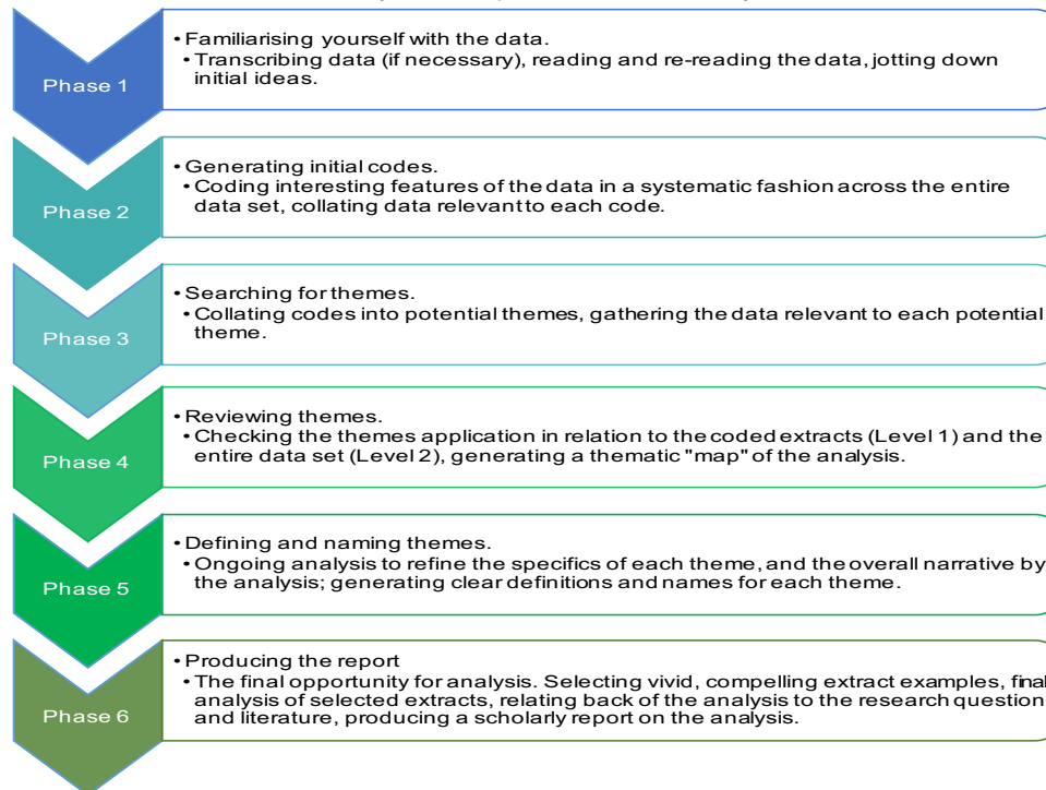
Figure 2 Summary of the six phases of thematic analysis