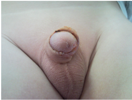
FIGURE 2: Same patient after recovery following medical treatment.

(cefazoline 100 mg/kg/day/3 doses) and oxybutynin was used in some cases (2 mg/kg/2 doses). A rifampicin dressing was used for signs of necrosis in ventral skin.