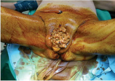
FIGURE 1: Massive cauliflower-like penile mass with several urinary fistulae making the penile shaft indistinguishable.

He underwent radical penectomy and a perineal urethrostomy was created. The surgical specimen was 11 cm length and 5.2 cm diameter. The urinary catheter was removed at the seventh postoperative day.