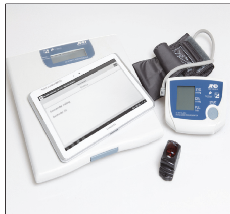
FIGURE 1: The Telekit system from the Danish TeleCare North trial. The COPD patients use Telekit to measure their vital signs.

the patients' answers to disease-related questions. In the light of this information, the healthcare providers can respond quickly and get the patients started on proper treatments [4]. Figure 1 shows the equipment that makes up the Telekit system.