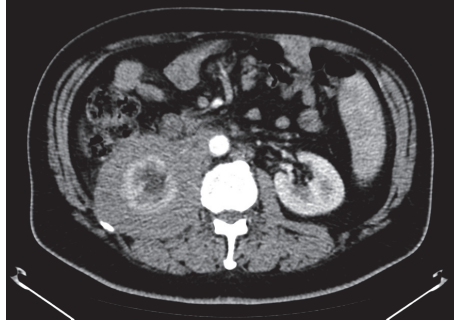
FIGURE 1: Preoperative computed tomography (CT) scan showing a right renal mass.