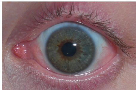
FIGURE 3: Patient with total limbal stem cell deficiency after chemical burn who was successfully treated with conjunctival-limbal autograft (2 years after surgery).