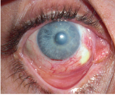
FIGURE 1: Limbal ischemia in the inferonasal quadrant 8 days after alkali burn. Patient subsequently underwent tenonplasty and conjunctival advancement to cover the defect.