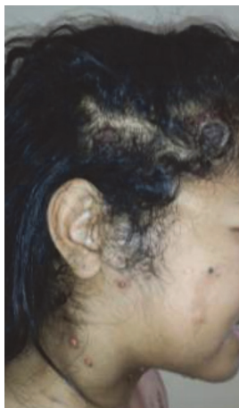
FIGURE 3: Ulcerated nodules on the scalp.

showed architectural disruption with polymorphic infiltrate composed of mainly foamy histiocytes and cytophagocytes; lymphoplasmacytes associated with neutrophils. Immunohistochemical stains showed S-100 and CD-68 positive histiocytes, but no staining for CD1a. The diagnosis of RDD was made. She received intravenous injection of methylprednisolone (2 mg/kg/d) for 3 days. On the third day of this treatment, she developed junctional tachycardia. Echocardiogram revealed septal hypertrophic with low LVEF 36% and noncompressive pericardial effusion, but no obvious nodules or masses were found. Because of circulatory collapse, electric cardioversion was required to restore sinus rhythm.