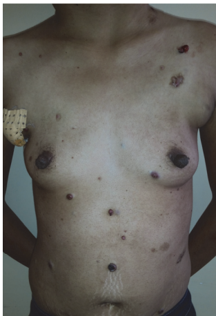
FIGURE 2: Disseminated multiples red brown papulonodules surrounded by satellite lesions on the trunk.