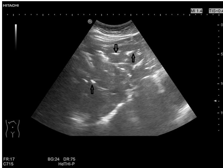
Fig. 1. Transabdominal ultrasonography showing marked pneumobilia. Pneumobilia means gas within the bile ducts (shown by arrows).