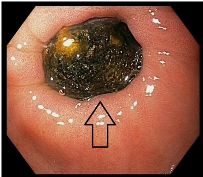
Fig. 2. Endoscopy revealed an impacted gallstone (arrow) in the duodenal bulb, causing outlet obstruction in Bouveret's syndrome.