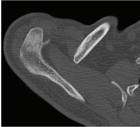
FIGURE 2: CT scan of the acromioclavicular joint demonstrating distal clavicle osteolysis compared to a normal joint.