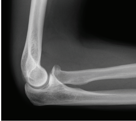
FIGURE 1: Mason I radial head fracture.